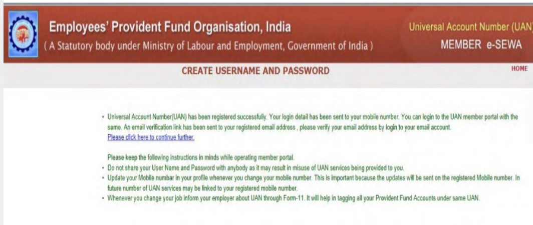
EPF UAN Confirmation

After submitting the, following screen will come and message will go to the member's phone for successful registration to access UAN driven member portal. Member must record this username and password to use it further. Remember your UAN would be the user ID